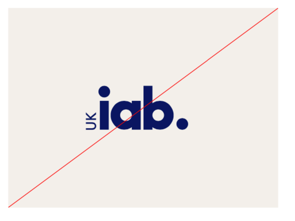
Don't change the position of the elements