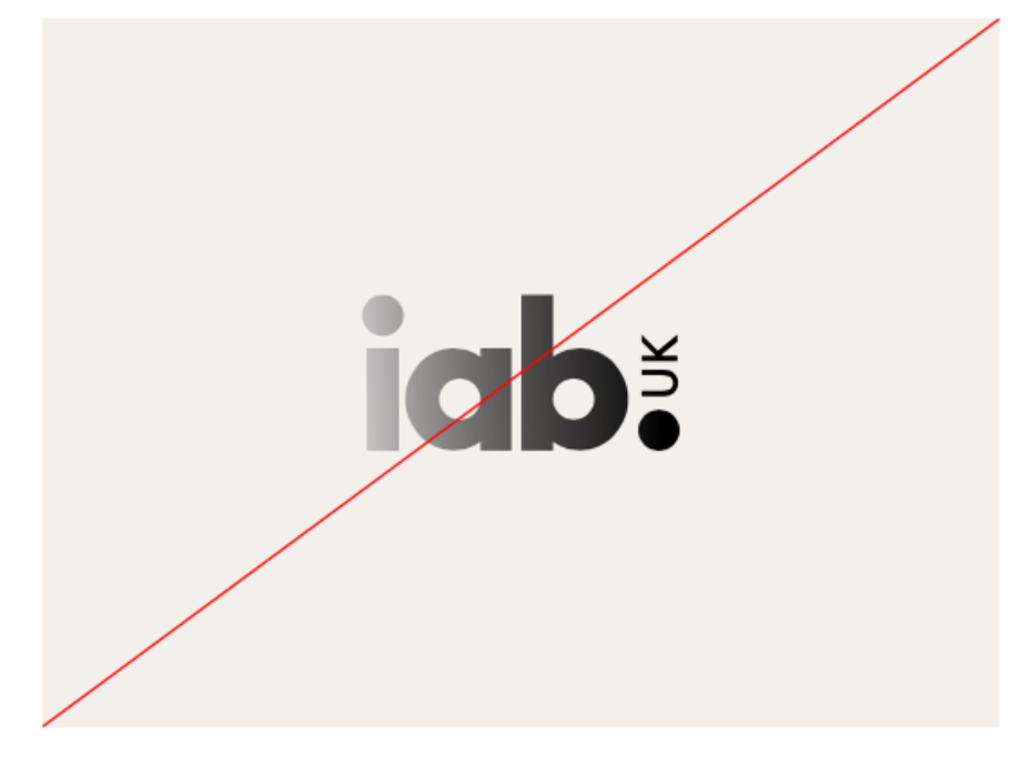
Don't use gradient on logo