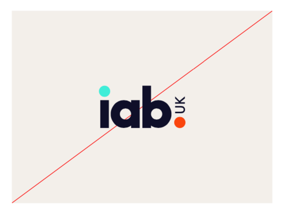
Don't use the old logo

Here are a few things to avoid when dealing with our logo.