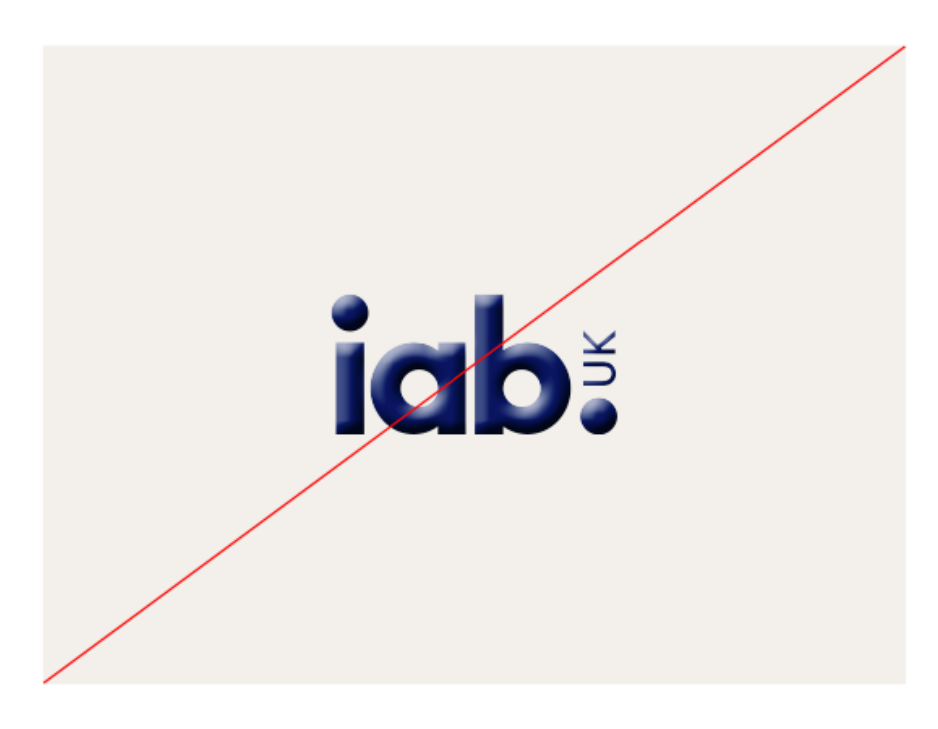
Don't apply effects on logo