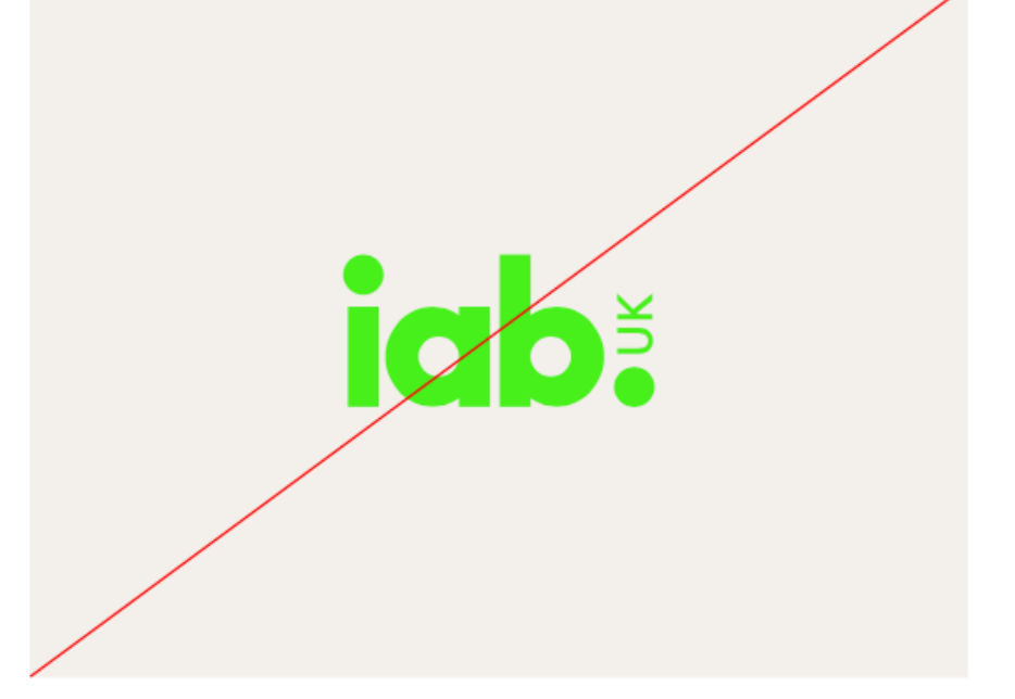
Don't use any of the secondary colours