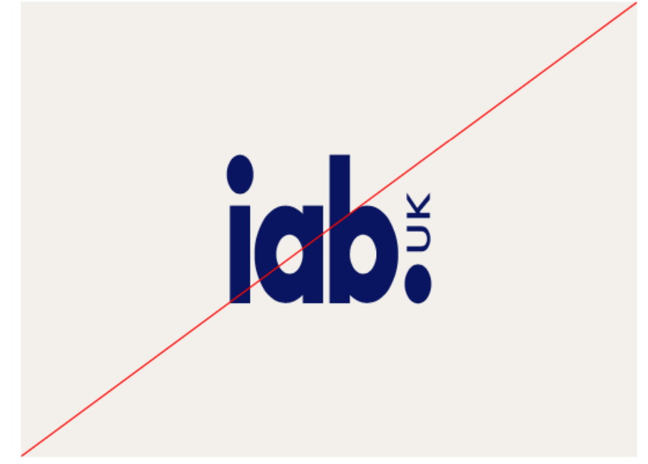
Don't distort the logo